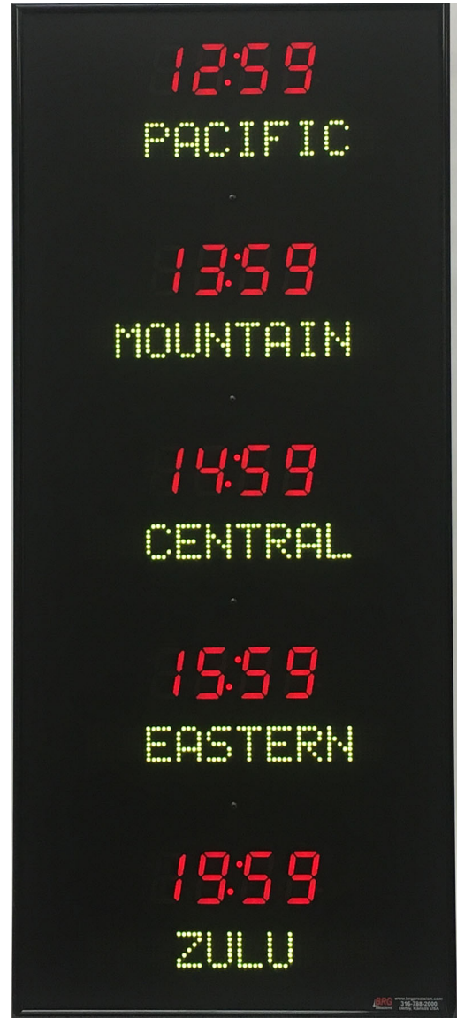
Model 3010C- 1.8" time, 1.2" zone labels, 5 zones